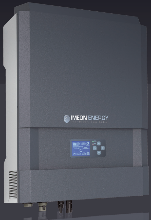
New IMEON 3.6 3kW PV input, 6kW AC output (2)

IMEON is a concentration of innovation and technology. Multi-sources phase coupling (Phase Coupling Energy, or PCE) is used to couple several energy sources (eg: PV / batteries / grid). There is no more need for source switching which often leads to micro-cuts. PCE solves the age long renewable energy concerns such as intermittence and fluctuation. IMEON's PCE has now made it possible to guarantee constant feed and optimal yields.